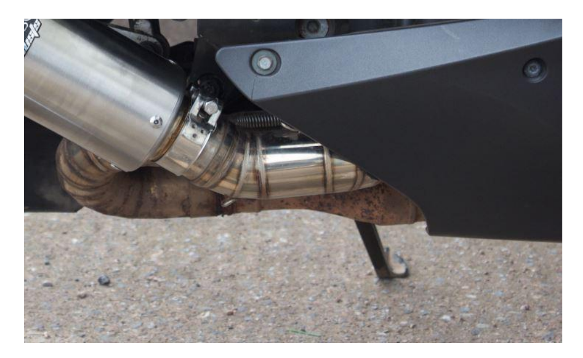
Once you are happy with the clearances then tighten both clamps to 14Nm and tighten the mounting bolt to 20Nm.